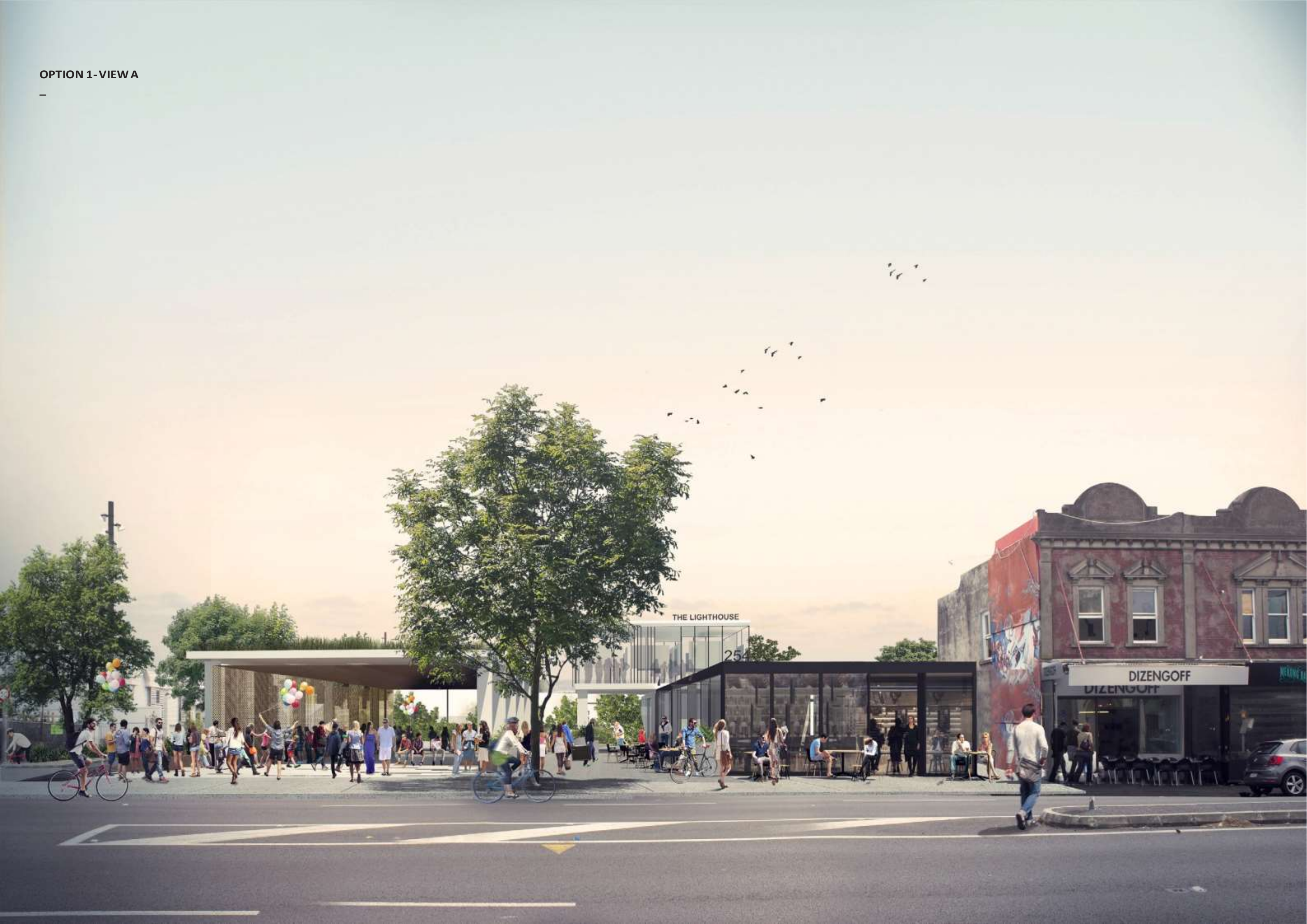
OPTION 1-VIEW A